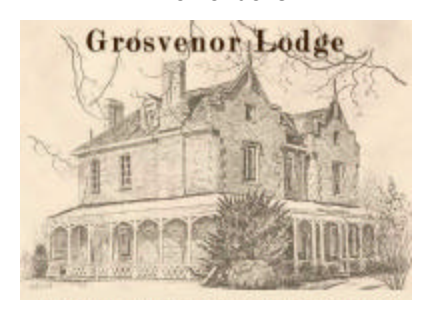
1017 Western Road, London